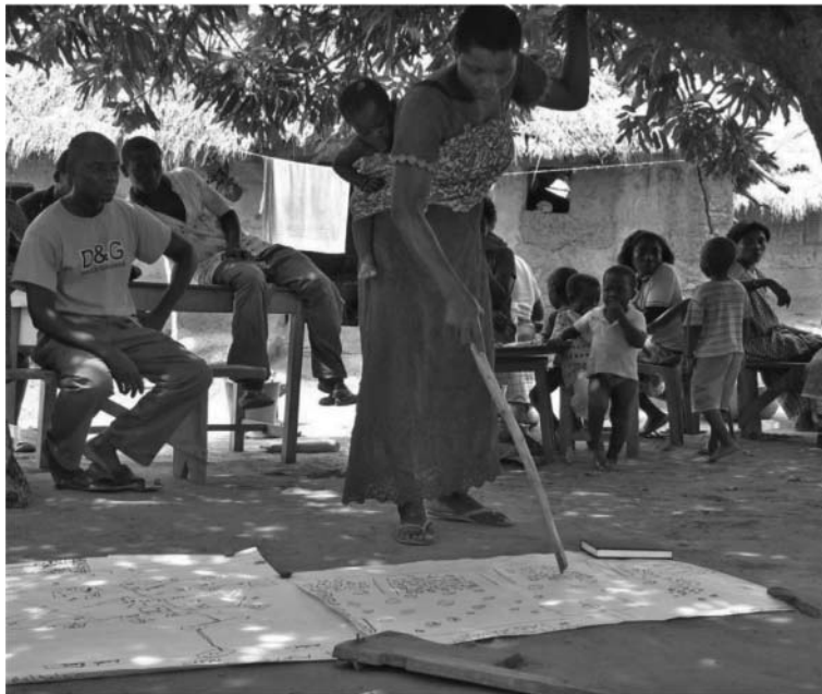
FIGURE 3 Woman in the Volta region of Southeast Ghana mapping well sites.